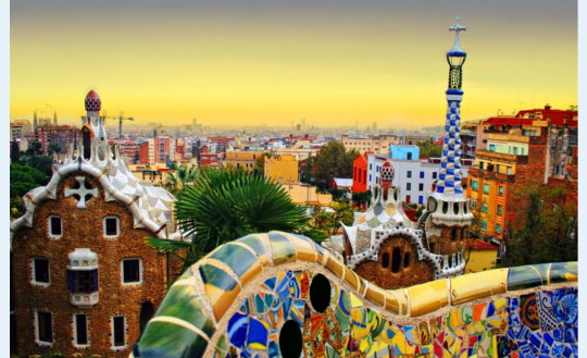
Park Guell overlooks the city's dramatic skyline.

A Brief History of Barceloneta Beach | Culture Trip (theculturetrip.com) Barcelona Facts for Kids (kiddle.co)