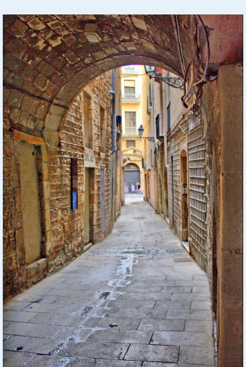
Get lost in the winding alleys of the Gothic Quarter

The Barceloneta Beach was built for the Olympics in 1992 and sand was shipped in from abroad. With shopping areas, museums and theatres only steps away from the beach, why wouldn't you want to visit?